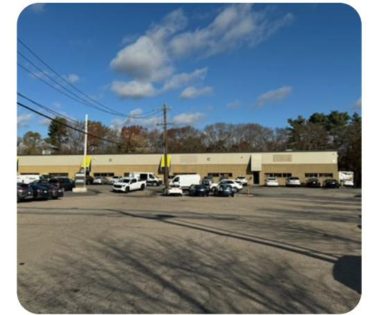
180 KERRY PLACE