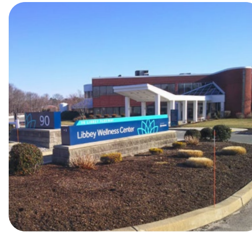
90 LIBBEY PARKWAY