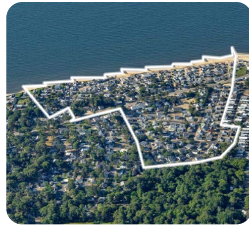
CHASES OCEAN GROVE