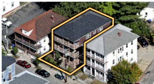
135-137 HAROLD STREET - 3 FAMILY