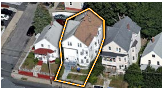
195-197 ADMIRAL STREET - 3 FAMILY