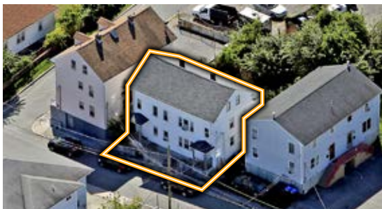
42-44 VETO STREET - 2 FAMILY