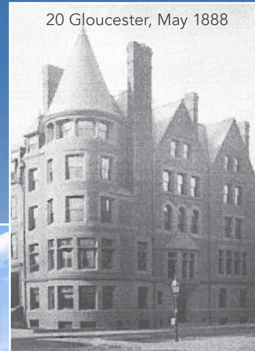
20 Gloucester, May 1888

Designed by prominent architects Peabody & Stearns, 20 Gloucester was completed in 1886 for Charles Francis Adams, grandson of John Quincy Adams – the 6th President of the United States. The design of 20 Gloucester features a sloping roof, a turret and huge chimneys. This handsome brick home traded between several prominent Boston families before becoming what is believed to be Boston’s first condominium conversion in 1969. Today, 20 Gloucester is a professionally managed 8 unit condominium with an elegant lobby, elevator, parking & basement storage & laundry.