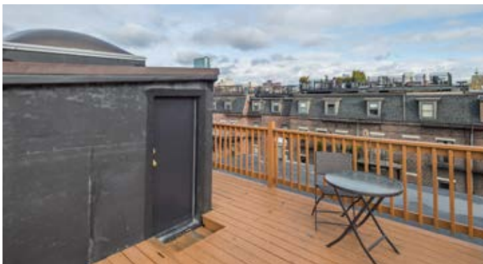
View from Roof Deck