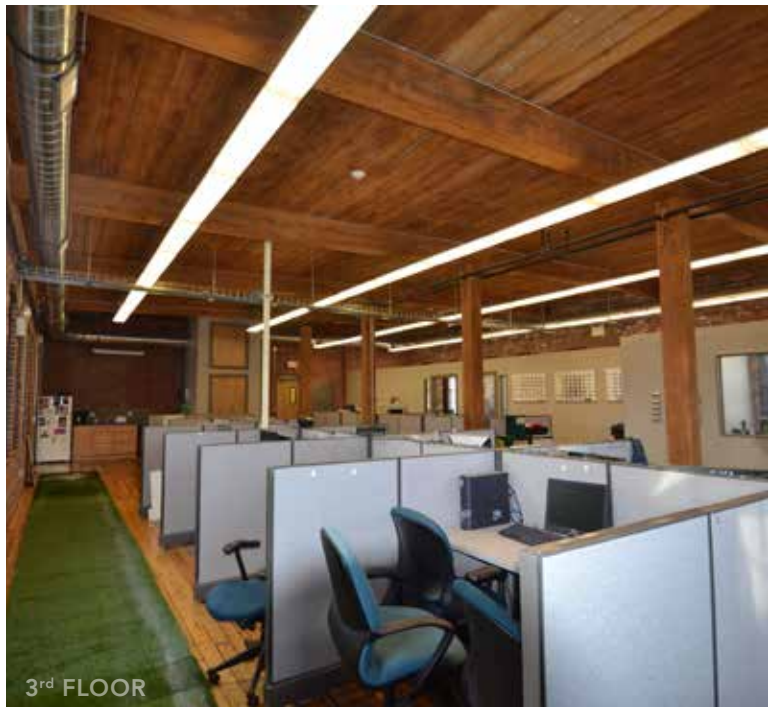
3 rd FLOOR

BONNY L. DOORAKIAN 617.850.9655 bdoorakian@bradvisors.com