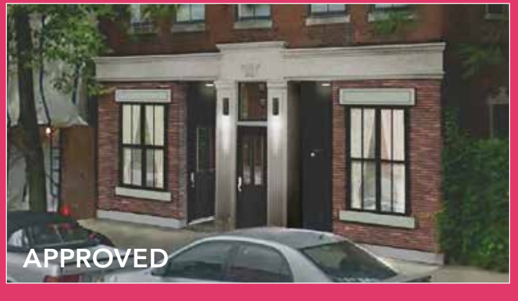
HISTORICAL APPROVAL FOR FACADE RENOVATIONS.