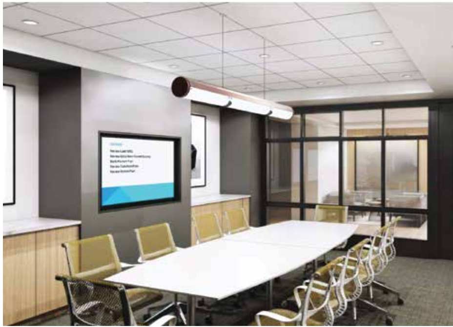
Renderings done by ID8 design