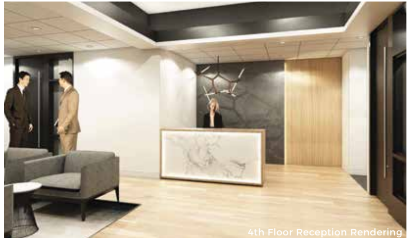
4th Floor Reception Rendering