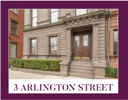
3 ARLINGTON STREET