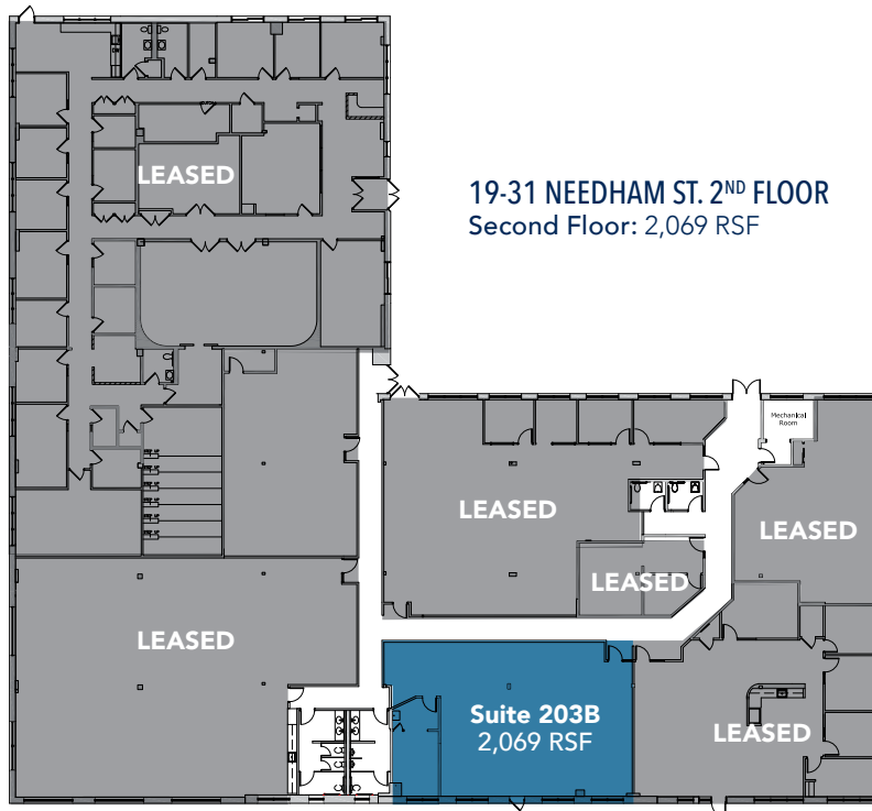
19-31 NEEDHAM ST. 2 ND FLOOR Second Floor: 2,069 RSF

ADAM T. MEIXNER 617.850.9660 ameixner@bradvisors.com